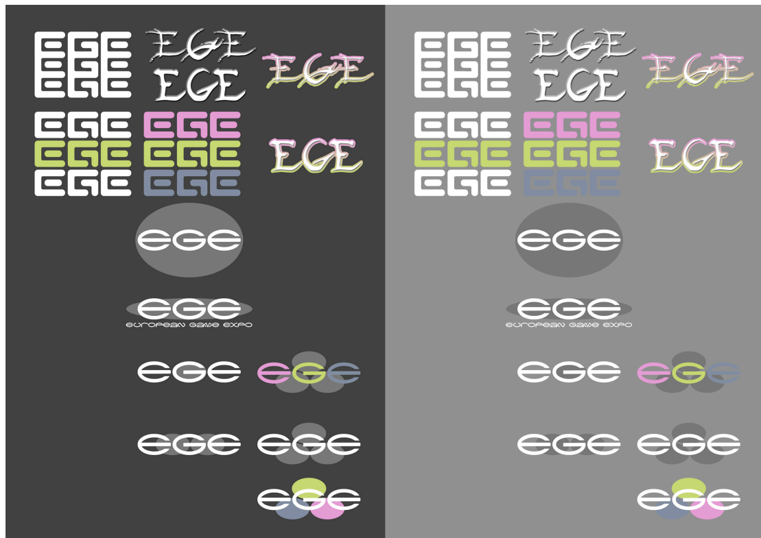
Figure 1: Tom's logo designs against dark and light backgrounds. The upper left-part can be used in a dark-grey pattern for an image background. The upper right-part is too chaotic/raw for a logo. The lower part has a techy feel to it.