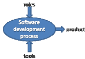
Figure 2: Software Development.

We would like to extend this idea by adding the details around - by describing the processes involved, the stakeholders and their roles and the tools used.