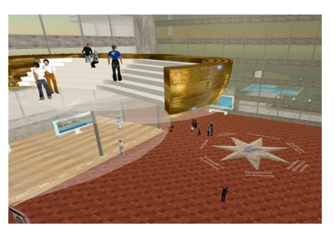
(b) visitors inside

It is indeed rewarding, once and a while, to enter the media circus. But of course, as (more or less) respectable academics, we are more serious than that. So, Mashups continued: More substantial than getting into a nation-wide television broadcast, however, is our aim to communicate our institutional goals, creating a community of learners, by creating a virtual campus in Second Life, offering an information portal as well as a meeting point, in a media platform that is widely adopted by our target community. Virtual presence in Second