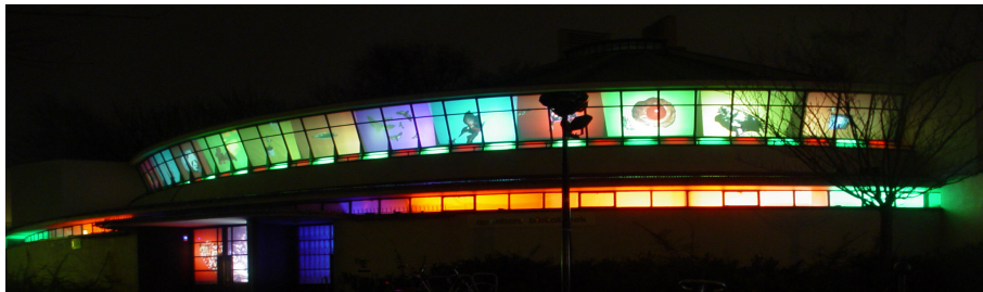
outside view of Tower of Babel project

And to conclude, digital dossiers will on the one hand contribute to making contemporary art forms accessible to a larger audience and on the other hand are explicitly meant to support the complex task of the conservation and re-installation of works of art in an effective manner.