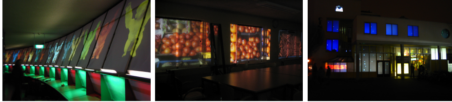
Inside view of Tower of Babel project.