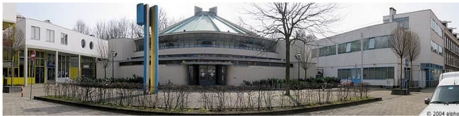
location of Tower of Babel project

Descriptions of items in the digital dossier should incorporate these elements, together with the attributes needed for the insertion of items in the concept graph and the presentation parameters, that are necessary for displaying the (media) material. Technically, the namespaces supported by RDF does allow for merging these different types of annotations. However, the challenge here is to derive the presentation attributes automatically, and to come up with a reasonable default for inserting these items in the concept graph.