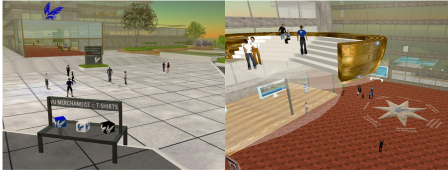
Fig 1. (a) visitors outside