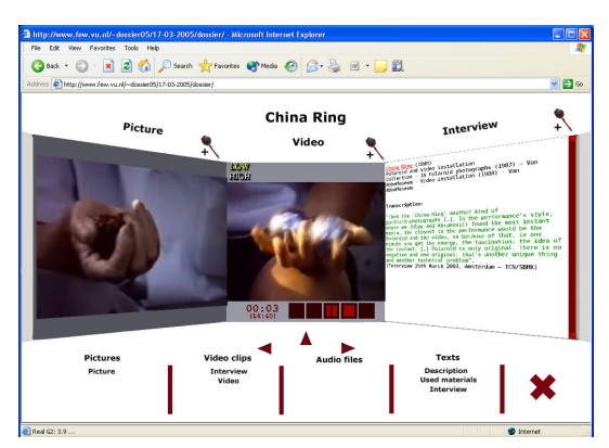
Fig. 2: Content gadget

Presentation is an essential part of the digital dossier but is separated from navigation. The digital dossier contains different presentation facilities for 2D and 3D content. For 2D media content we need to be able to present video, images or textual information. This is implemented as a presentation gadget with three windows, fig 2. In each of the three windows the user can view either text, image or video content. The windows are positioned in such a way that the user can inspect the information simultaneously. In our experience, three views can be presented at the same time without much visual distortion.