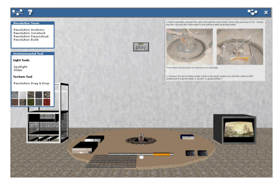
Fig. 4: Construction tool

A special case of a guided tour is the tool environment constructed for the Revolution installation of Jeffrey Shaw, which allows for experimenting with the (de-) construction of the installation, fig. 4, and exhibition parameters, fig. 5.