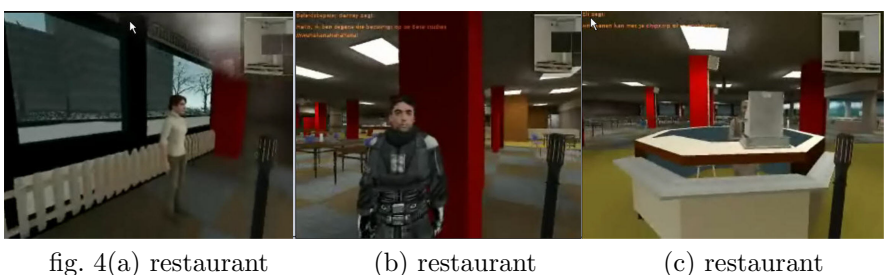
fig. 4(a) restaurant (b) restaurant

As illustrated in figs. 1-3, the puzzle squares will gradually become filled, and when complete, the combined puzzle squares will indicate the location of the hidden treasure, which is the 7th row of chairs of the lecture room in fig. 1(b).