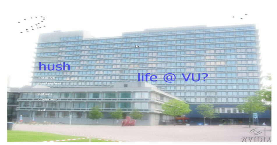
fig. 1: VU-Life 2 - opening screen

With only about eight months time, we decided to do a feasibility study first, to gain experience with the Half-Life 2 SDK technology, and to determine whether our requirements for the game and the masterclass could be met.